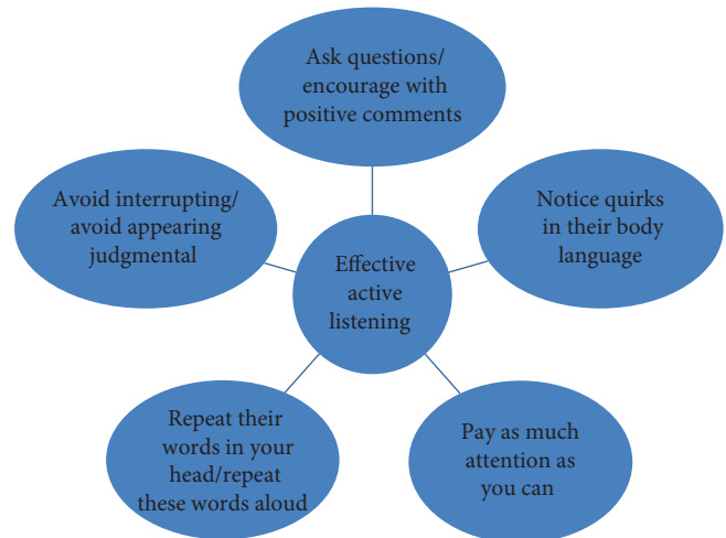
FIGURE 4: Tips for the effective listening for the determined business communication skills.

During the next video-conferencing via Zoom (which was conducted with the invited stakeholder from the Berdansk Sea Port), students discussed active listening with the