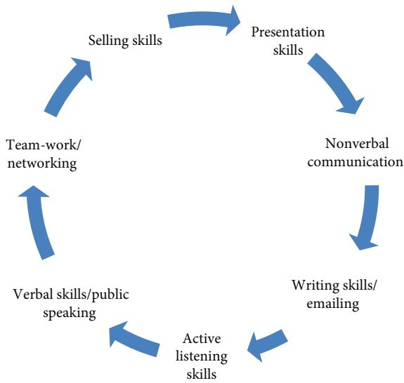
FIGURE 3: Determined business communication skills.

They were able to represent themselves during the formation of their BCS. We have proposed to analyze and to explain the diagram (Figure 3), which comprises the determined BCS.