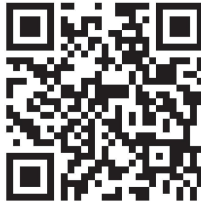
FIGURE 5: Sample of QR code for the work within the classroom.

Thus, during the planning of the lesson on business English, you are able to share with the students with the appropriate material and to implement the additional online resources, which will intensify their positive motivation for their studies and self-development. For example, working with the material, devoted to marketing, we propose to